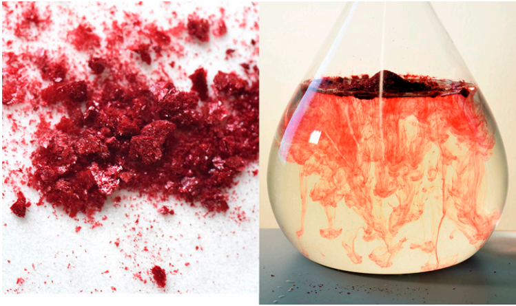
In an attempt to develop a product that mimics aspects of blood, researchers are testing a product called ErythroMer. Stored in powder form, it has a shelf life of several years, which could help serve critically ill patients in remote locales.