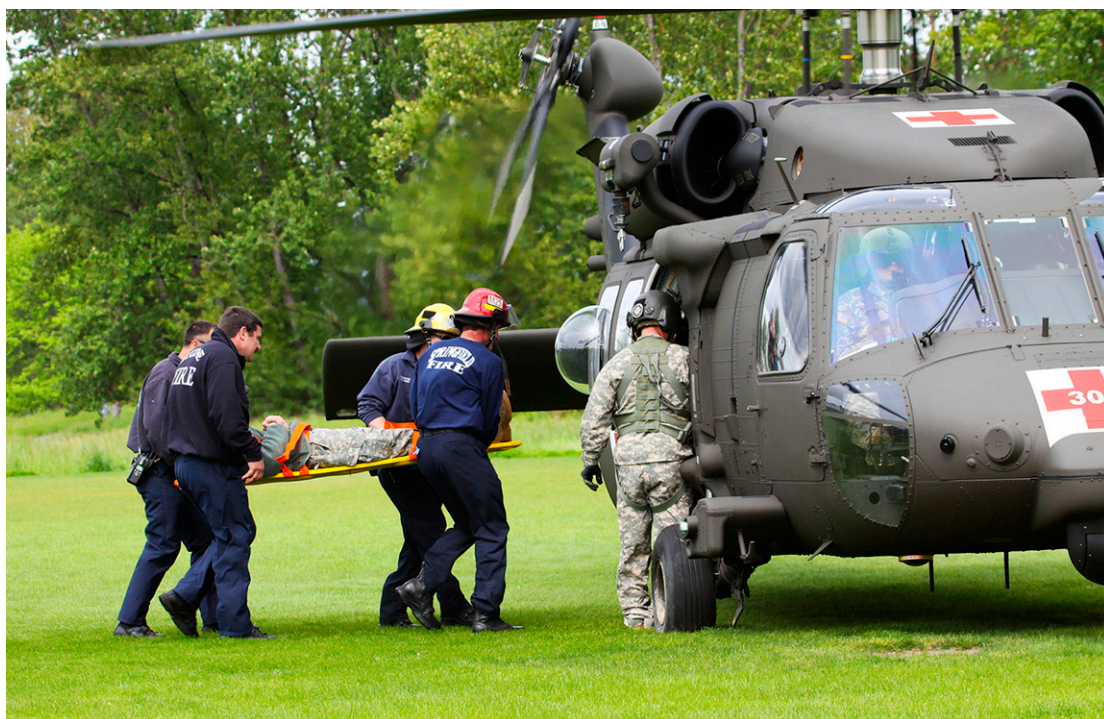
To save the lives of patients in dire need of blood, hospitals and emergency responders don't necessarily need more blood collection. They need better access to and storage of blood, and, ultimately, production of shelf-stable blood components.

Hemorrhaging patients rarely receive whole blood; instead, they receive reconstituted blood components.